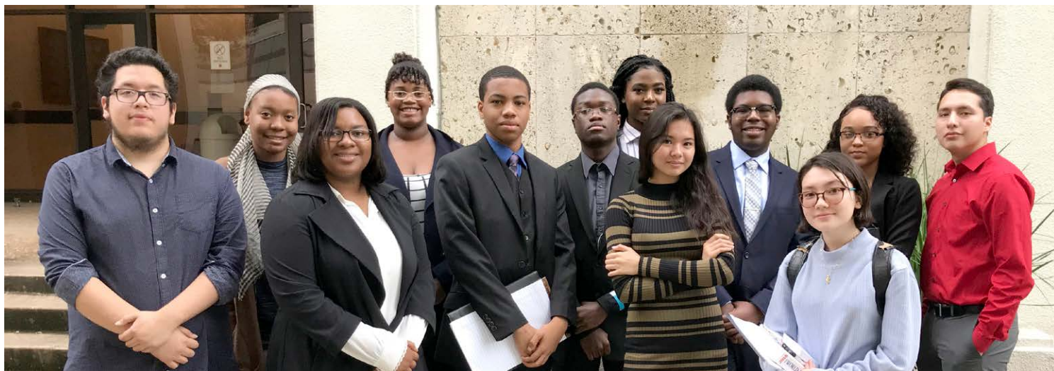
CASE Debates team from Spring ISD archived photo