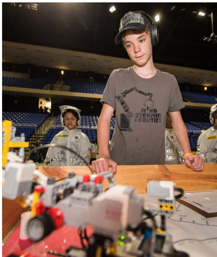
Ecobot Challenge 2019 archived photo

Through quality support, CASE for Kids supports afterschool professionals with professional development and an afterschool library with games, software and tangible, hands-on resources called the SMART Zone.